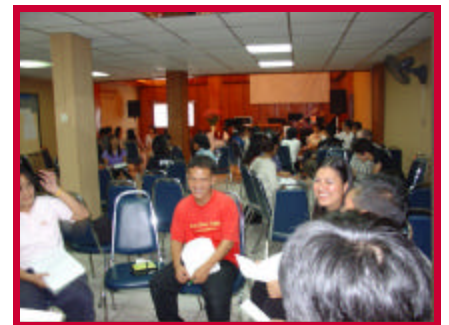
The last Sunday of each month, TLC hosts "Special Friend Day," where all are encouraged to invite a friend. Above is one of the activities of September's Special Friend Day.