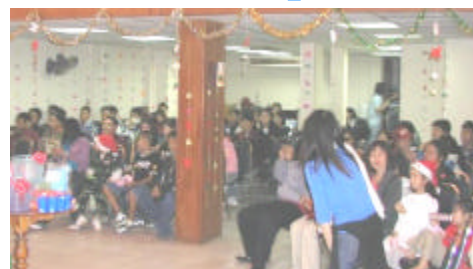
2004 Christmas program at TLC